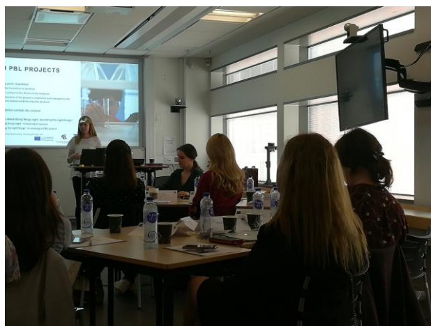
Image 1-4. PBL training: lectures and workshops (first day of the training)