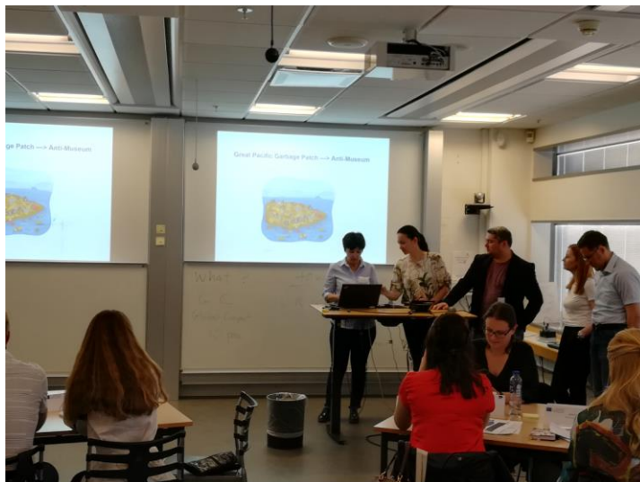
Image 5-8. PBL training; Presentation of mini-projects (second day of the training)