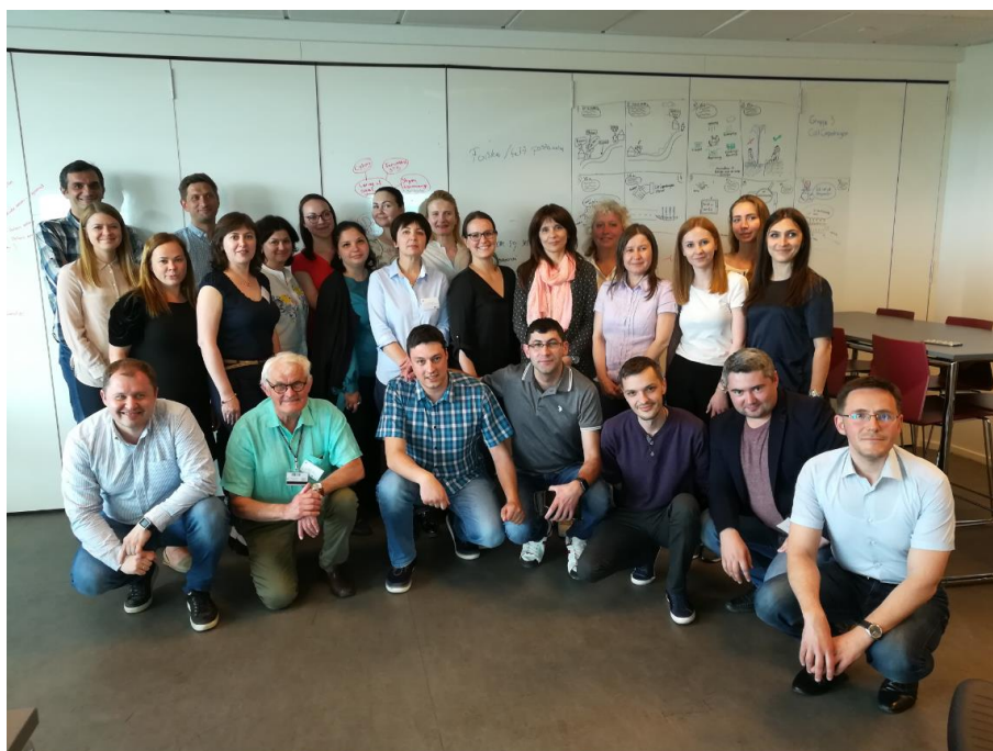
Image 9. Participants of the MILETUS PBL training in Copenhagen (03-04 June 2019).