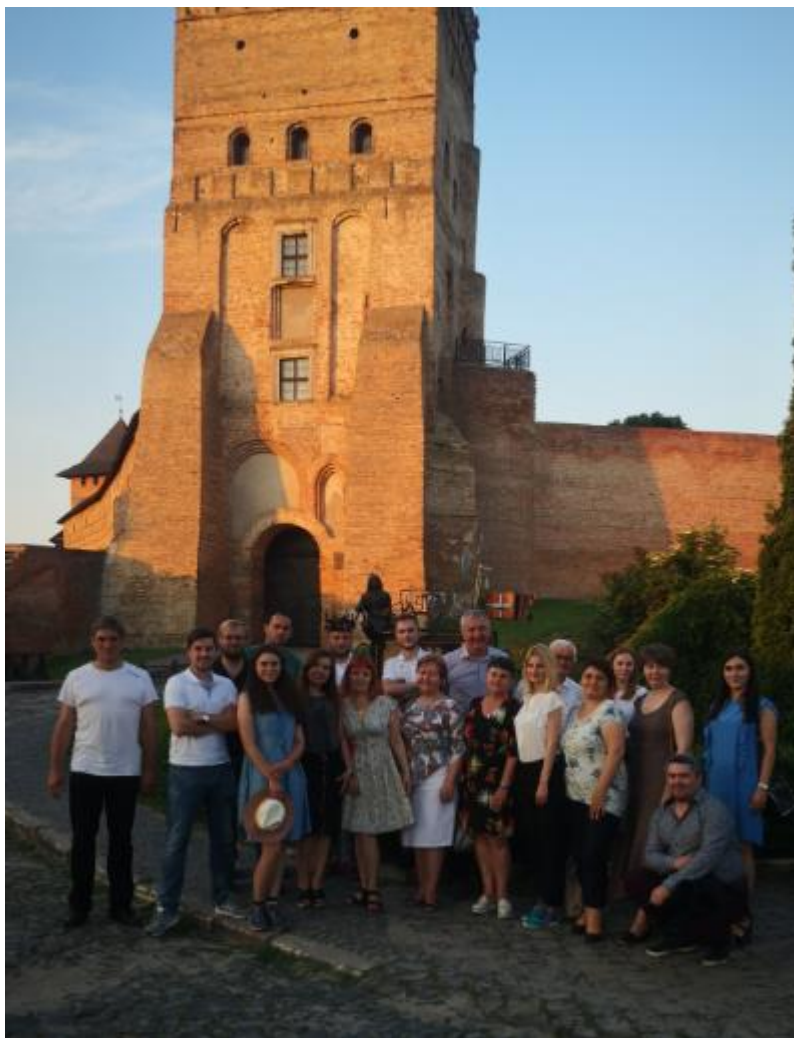
Image 16. Participants of the MILETUS project meeting in Lutsk/Shatsky district (11-13 June 2019).