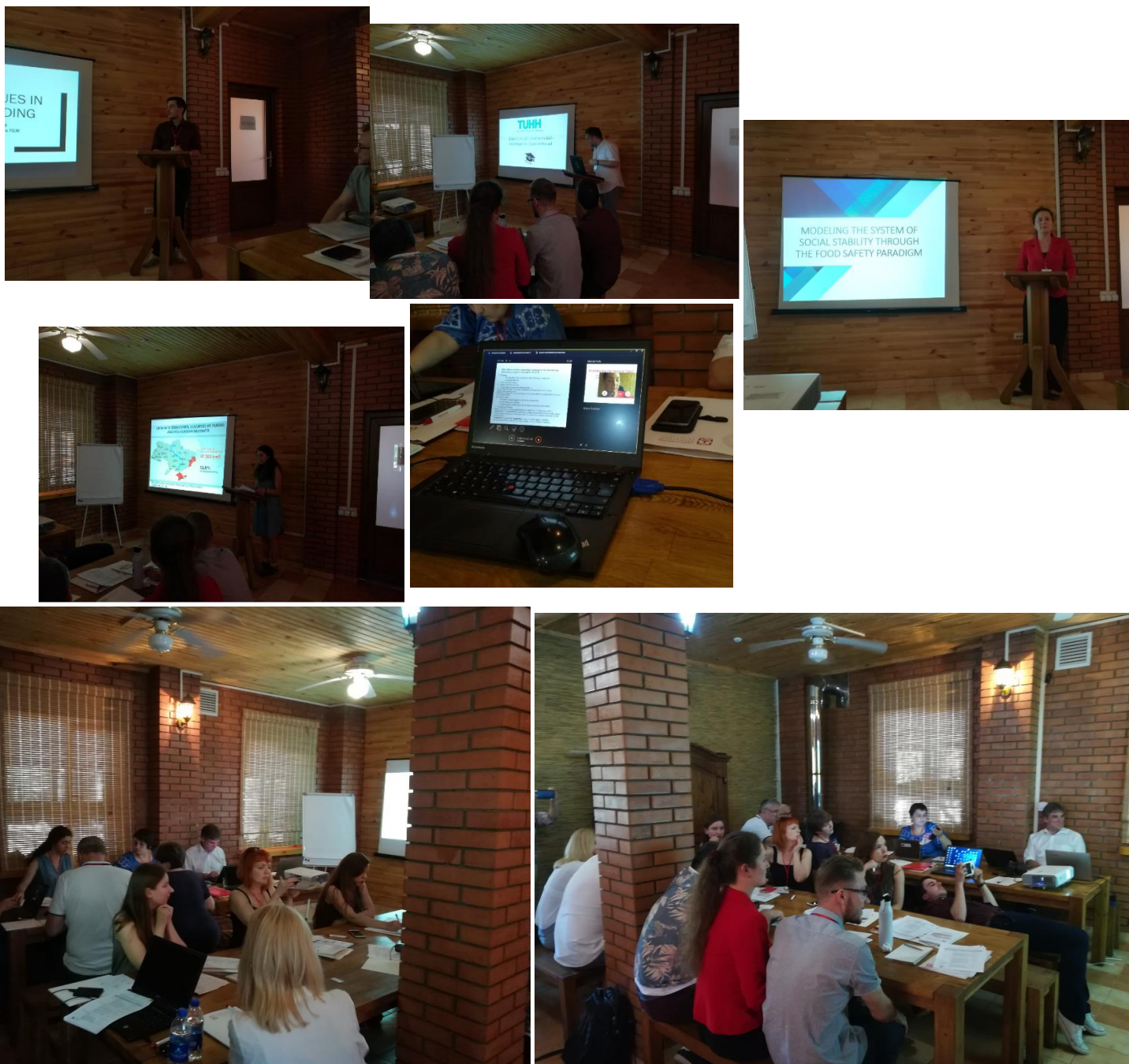
Image 1-7. Project conference: PhD students presentations (first day of the project meeting)