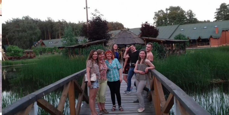
Image 9-10. Closing the first day session for PhD students and supervisors (first day of the project meeting)